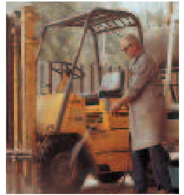
The high pressure spray option goes to work wherever you need it — blasting away grease, oil and dirt.

An optional squeegee wand attachment hooks up easily and simplifies picking up remote spills. An overhead guard is also available which meets OSHA standards.